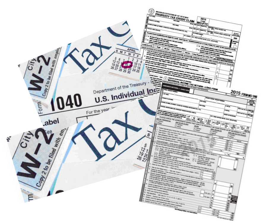
Have a question about taxes? Look inside for the answers . . .